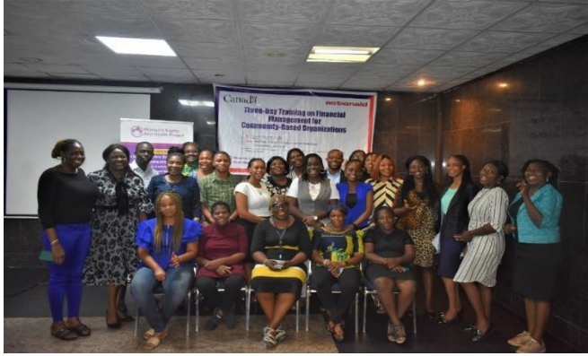
Institutional Capacity Building Programmes for CBOs