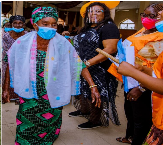
Transforming the wellbeing of older women in Lagos State