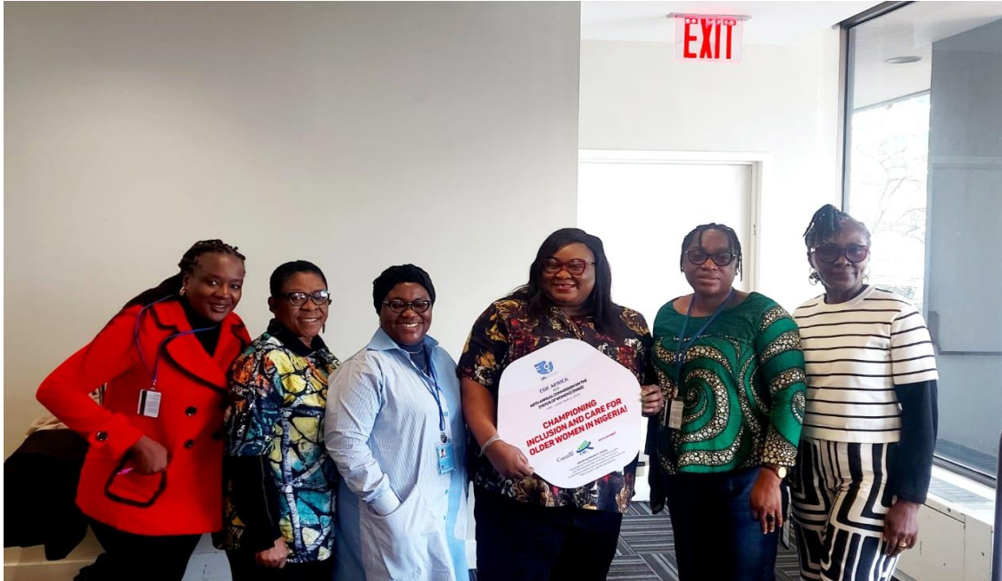
Proudly advocating for the inclusion and care of older women in Nigeria at the United Nations Commission on the Status of Women (UNCSW) 68 in New York, in 2024