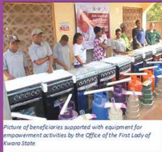
Picture of beneficiaries supported with equipment for empowerment activities by the Office of the First Lady of Kwara State.