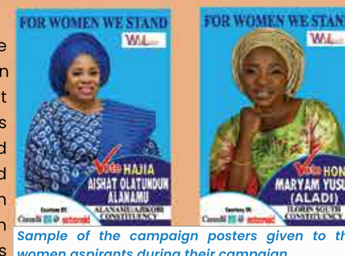
Sample of the campaign posters given to the women aspirants during their campaign