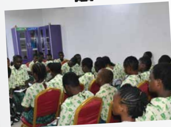
Students during mentorship program