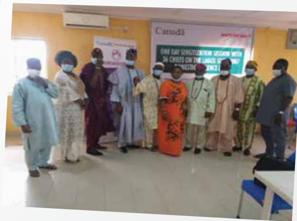
Engagement of Traditional rulers