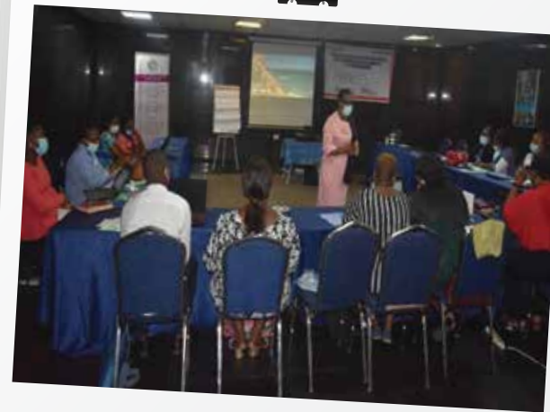
Training of 12 CBO partners on Financial Management