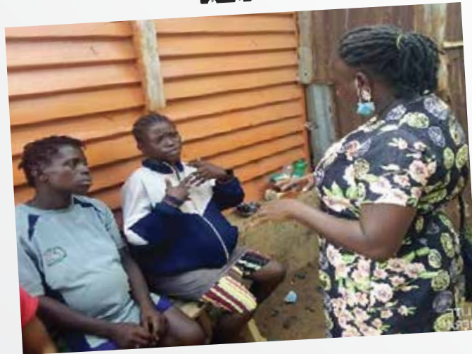
WRAHP during interview and a Sign Language Interpreter communicating interview questions to one of Hearing Impaired Women