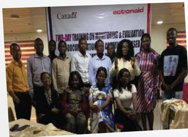
Training of 12 CBO partners on Monitoring & Evaluation

Successfully built the capacity of 12 women led Community Based Organisations (CBOs) on Organisational Development system strengthening and case management of SGBV.