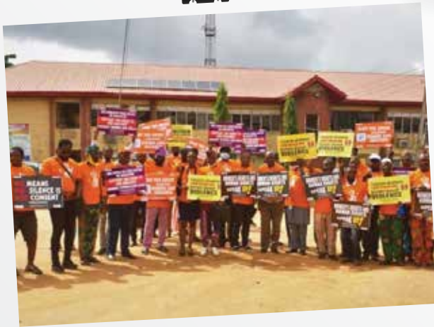
Men-Led SGBV Campaign