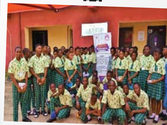
In-school Young adolescents sensitized on SRHR

Meeting with Canadian High Commissioner Nicholas Simard to discuss key women's rights issues in Nigeria